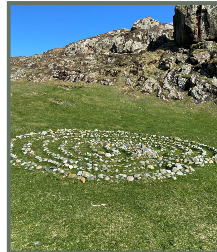
A Prayer Labyrinth on the island of Iona