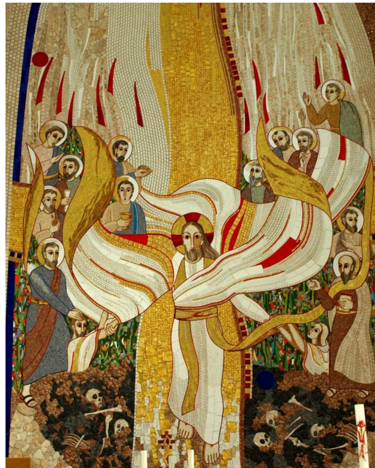
Marko Ivan Rupnik (Slovenian, 1954-), Resurrection of Christ (detail), 2006. Mosaic, St. Stanislaus College Chapel, Ljubljana, Slovenia.

When you feel ready to move on, spend some time taking in this beautiful mosaic. As you look at it let your eyes worship, explore the different characters. Let the Spirit inhabit your thinking as you take in this piece. Breathe slowly and deeply.